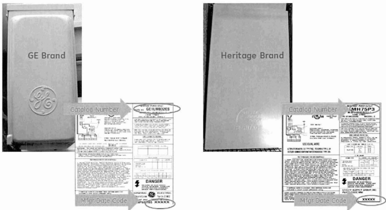
Figure 4 - Midwest RV Power Outlet/Pedestal Catalog Number & Mfg Date Code