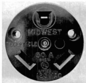
Figure 1 - Midwest 30 Amp, 125V Receptacle (Ground Clip location circled in RED)

GE is initiating a voluntary recall of certain Midwest 30 amp, 125V receptacles manufactured between May 21, 2012 and July 20, 2012 due to a potential manufacturing irregularity in a formed metal component used in the receptacles. The affected component, referred to as the "ground clip", is located behind the receptacle's plastic face plate as shown in Figure 1.